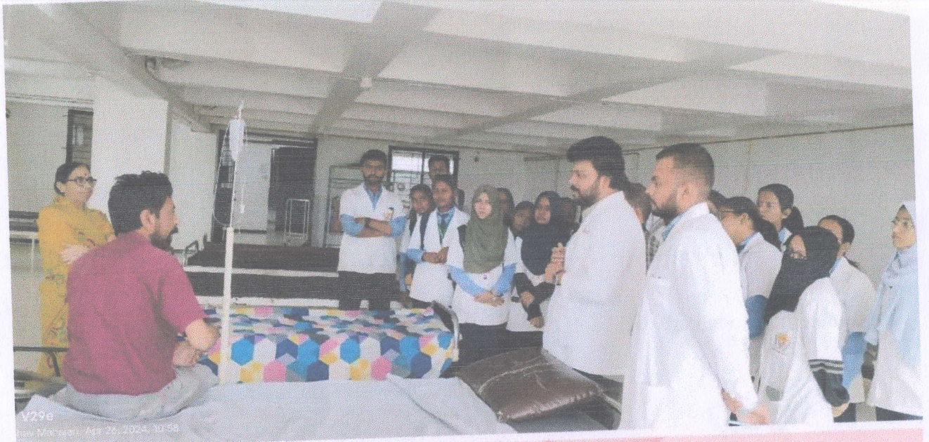
V29e Nov 2024, Apr 26, 2024, 10:58