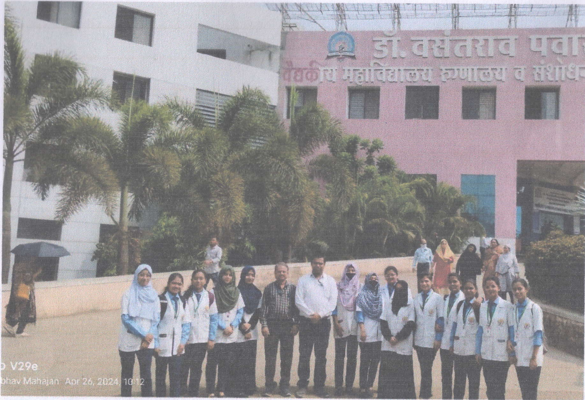
© V29e Smita Mahajan, Apr 26, 2024, 10:12