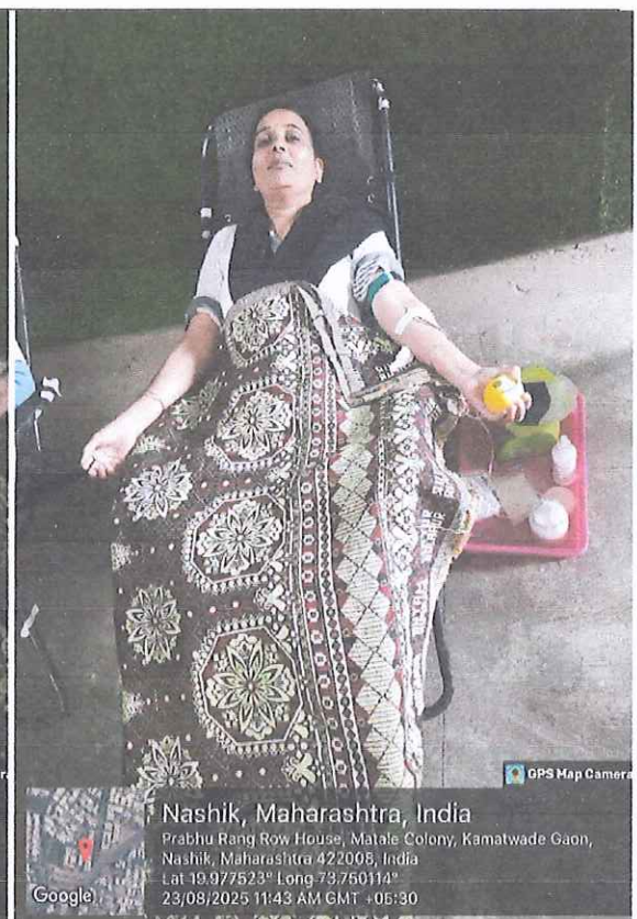
Non teaching staff donating blood