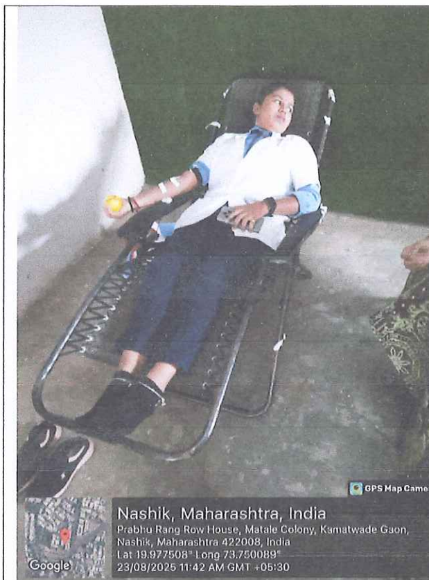
Students donating blood